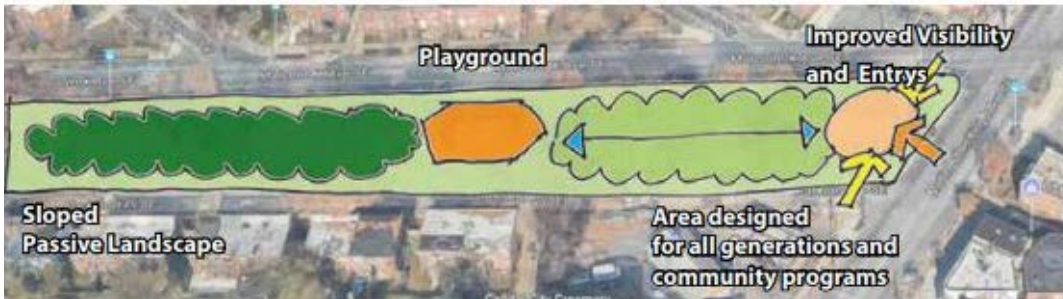
Improving Shepherd Park: through design and programming