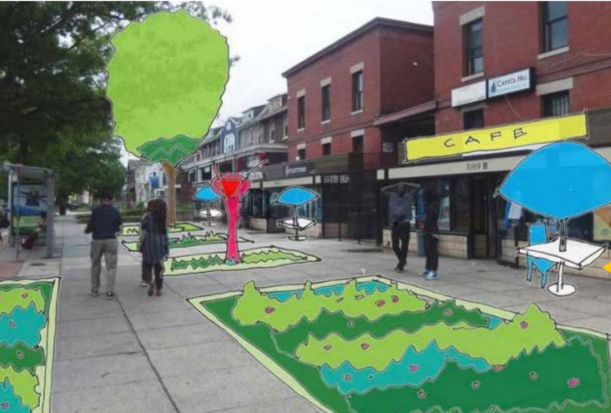
Greening and creating seating in the public realm